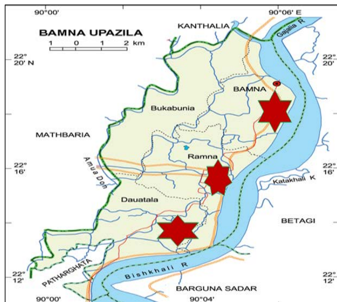
Fig 1: Study area in Bishkali River (Bamna Upazilla)

into the Bay of Bengal through the mouth of the Baleswar-Haringhata at 13 km down of Patharghata. The total length of the river is 96 km. The average width of the river from its origin to first 30 km is about 1 km and the rest is about 2 km. The average depth is about 16 m [5].