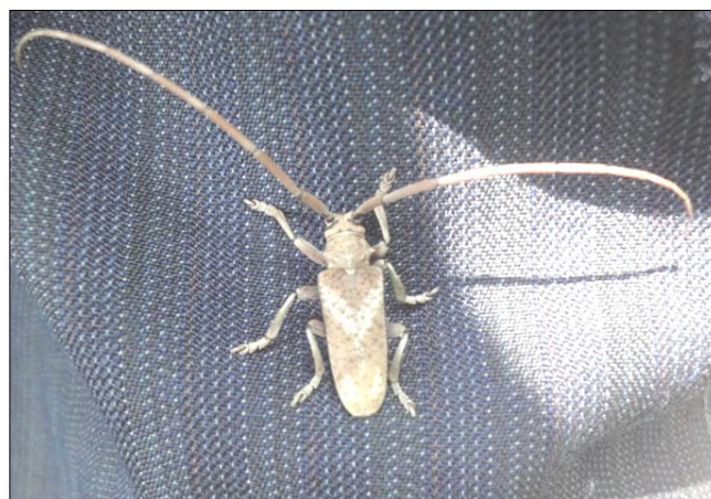
Fig 1: Dorsal view of Blephephaeus nepalensis Hayashi, 1981

Body was elongated, large, pale brown in colour, head elongated. Antennae were punctuate, pale brownish in colour and longer than body. Legs were also pale brown in colour and femora with flatten bulges. Often found on bushy plants, well camouflaged with surroundings. (Figure 3)