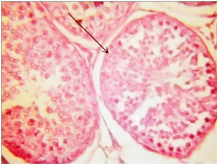
Fig 2: Microphotograph of goat testis showing spherical-shaped seminiferous tubules (arrow), stained with H&E (400X).