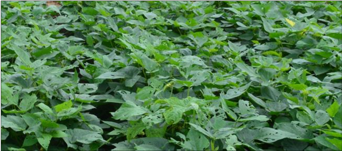
Fig 1: Damage by larvae of Anticarsia irrorata Fabricus