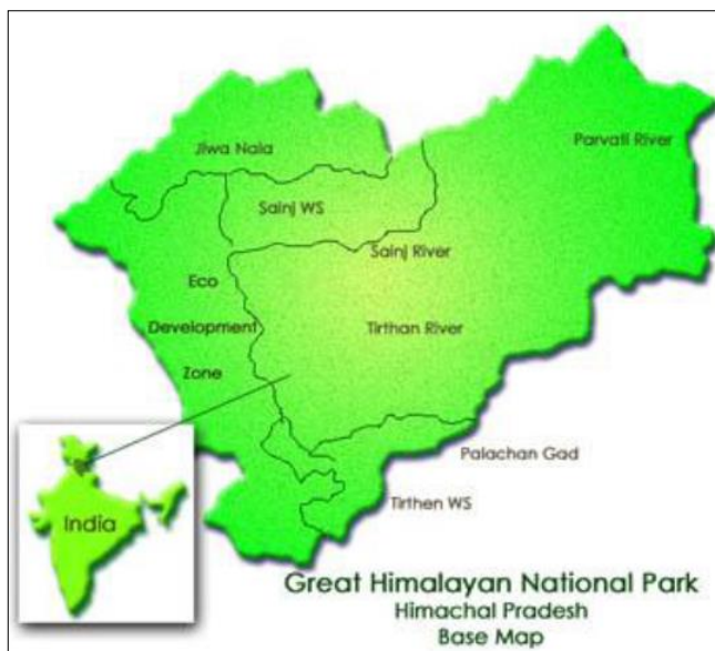
Fig 2: Base map of GHNP

was formally declared a National Park in 1999, covering an area of 754.4 sq kms. In 1994, two major changes were made in land use around the Park. A buffer zone of 5 km from the Park's western boundary, covering 265.6 sq km, and including 2,300 households in 160 villages, was delineated as an Ecozone. Most of the population (about 15,000 to 16,000 people) in the Ecozone. The second change was the creation of the Sainj Wildlife Sanctuary (90 sq km) around the three villages of Shagwar, Shakti, and Marore. On the southern edge of the GHNP, another Protected Area (PA) was declared, known as Tirthan Wildlife Sanctuary. This covers 65 sq km and is without habitation. More recently, in 2010, both the Sainj and Tirthan Wildlife Sanctuaries were added to GHNP, but will not be formally incorporated until a process known as settlement of rights has occurred. Thus the initiated merger of Sainj and Tirthan Wildlife Sanctuaries with GHNP will be followed by a process of settlement to relocate inhabitants and make the area free of traditional pressures, which may take some time. The total area under Park administration (National Park, Wildlife Sanctuaries and Ecozone) is 1171 sq km, which is together referred to as the Great Himalayan National Park Conservation Area (GHNPCA).