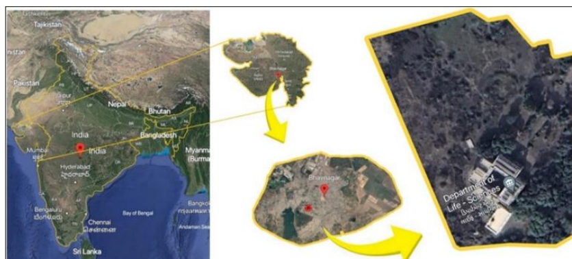
Fig 1: Map of study area [18]

At Department of Life Sciences, Saradar Patel Campus, Maharaja Krishnakumarsinhji, Bhavnagar University; lies between 21.756002N & 72.129193E [8] . The Campus scenery is overspread with diverse vegetation and remaining part is open land with rocky topography. The campus also possesses a seasonal lake that remains filled for around 6 months throughout the time of monsoon. The campus of Department of Life Sciences is rich in their vegetation. We observed many host plants of butterflies and moths which fulfil their needs of habitat and provide food supply especially for their larval stages.